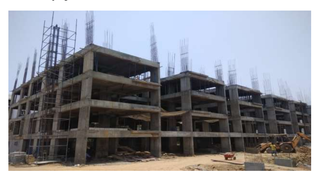
In Block B2: Pile Cap Shuttering & Bar Bending on progress..