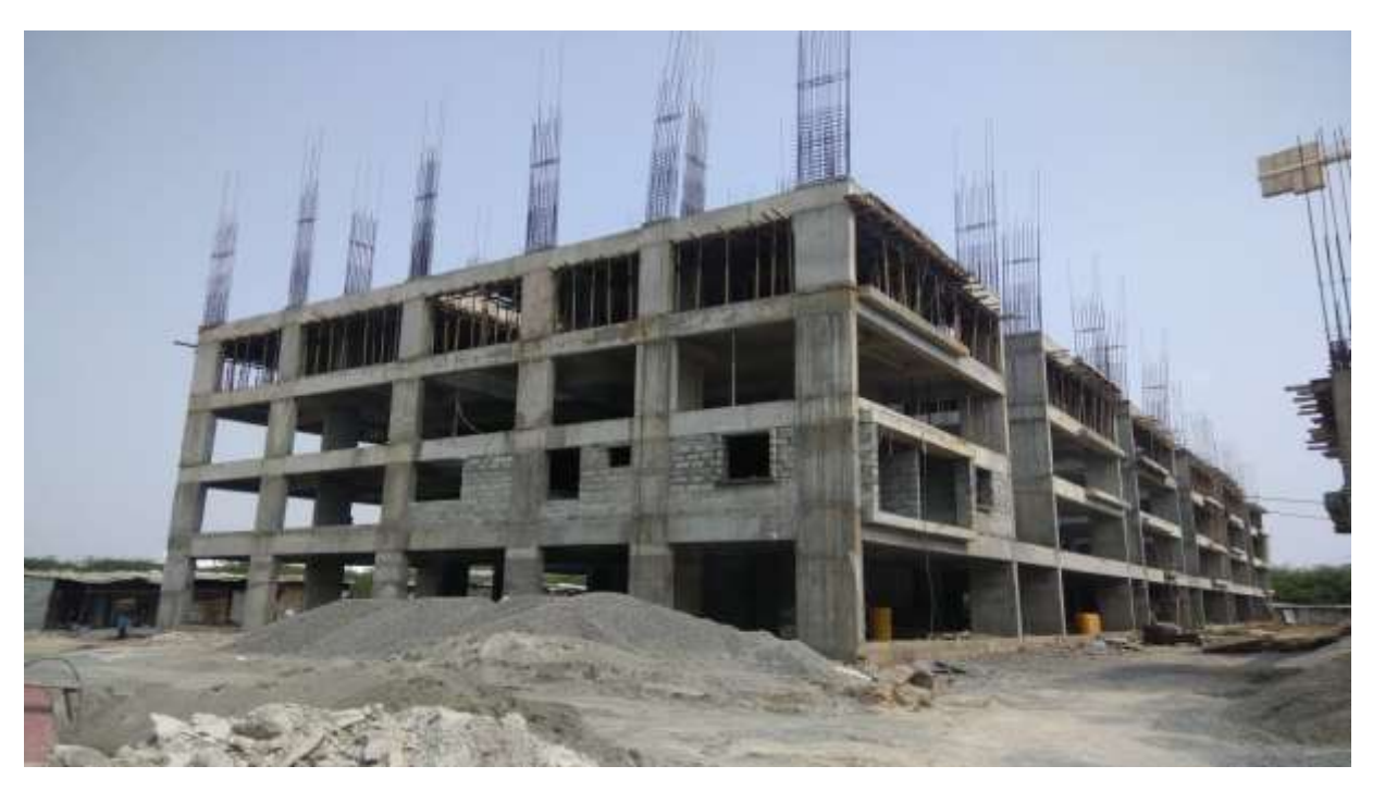
In Block C2: Second Floor level Slab 2<sup>nd</sup> half Shuttering & Bar bending work in progress.

In Block C1: Fourth Floor level 2^{nd} half Shuttering & Bar bending work in progress.