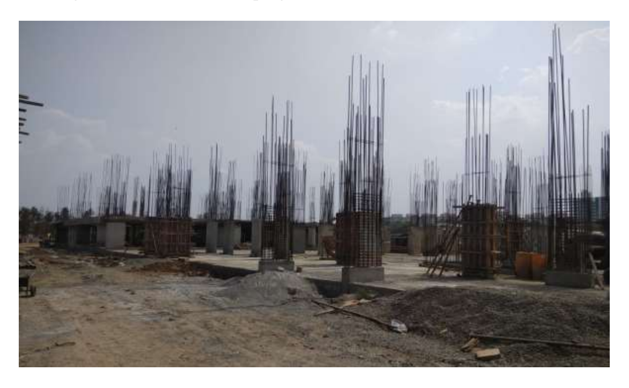
In Block D1: Excavation, Bar bending & Shuttering for Pile cap work on Progress.

In Block C3: First Floor level Slab 1^{st} half Concrete completed . Shuttering & Bar Bending Work for columns on progress.